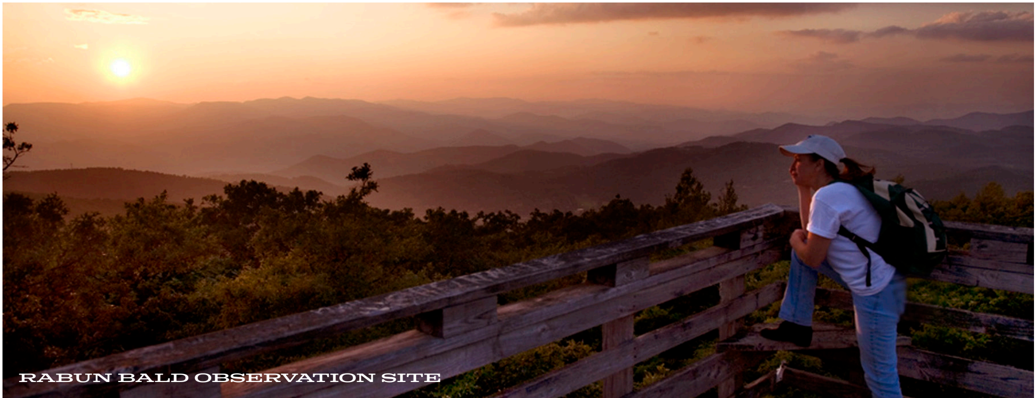
RABUN BALD OBSERVATION SITE